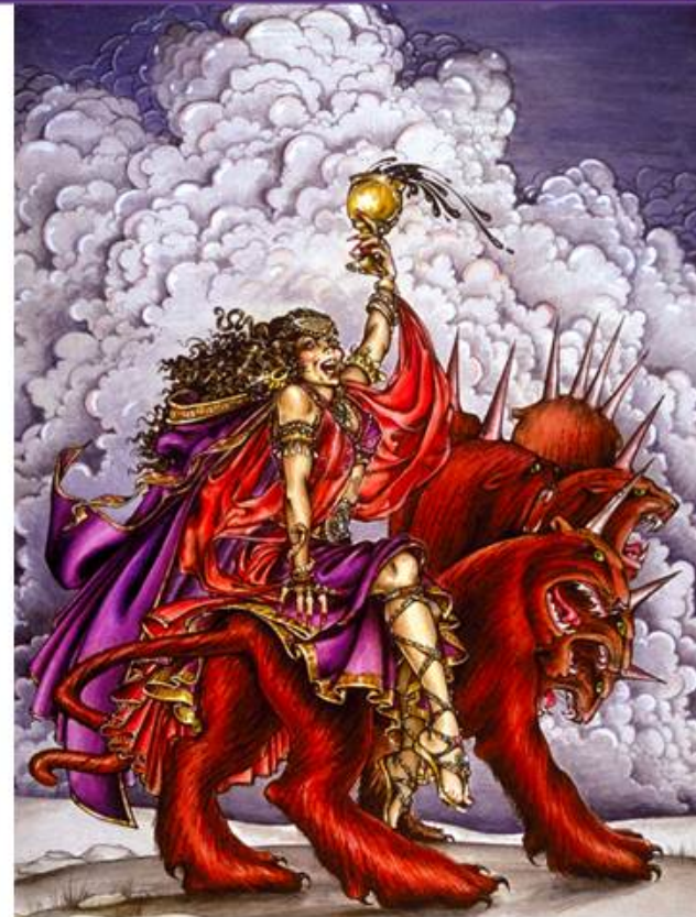
The Harlot of Babylon: She is the 13 Families Who Control All the World By Ruling Over All the Nation's Governments

Mark 13:14 14 "So when you see the 'abomination of desolation,' spoken of by Daniel the prophet, standing where it ought not " (let the reader understand), Matthew 24:15-28 15 "Therefore when you see the 'abomination of desolation,' spoken of by Daniel the prophet, standing in the holy place ", Zechariah 5:7-8a Here is a lead disc lifted up, and this is a woman sitting inside the basket"; then he said, " This is Wickedness! "