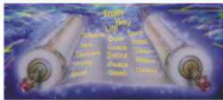
Veil of the Temple is Torn